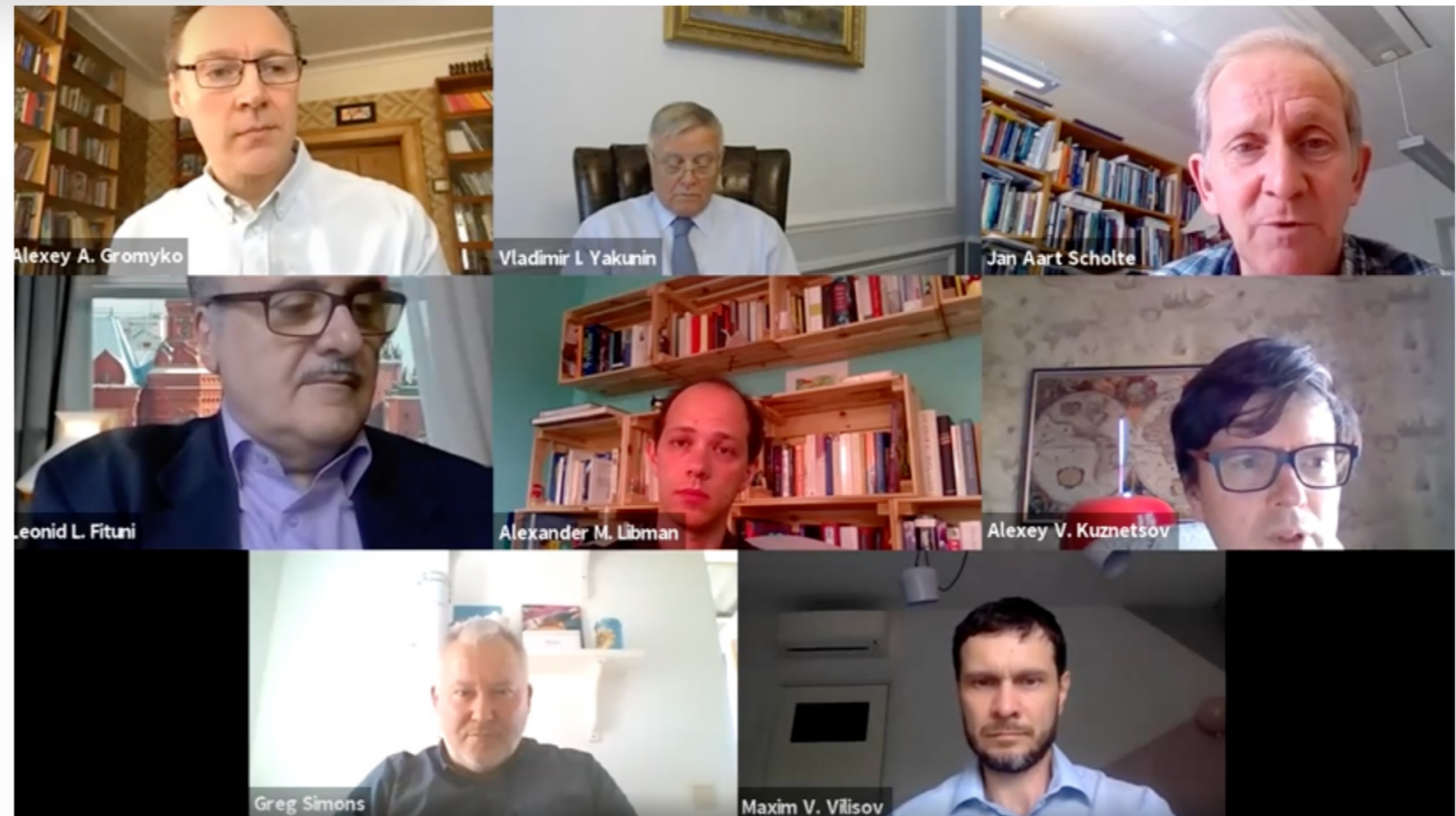
Panel Discussion "Global Transformations and Global Challenges, 06.2020