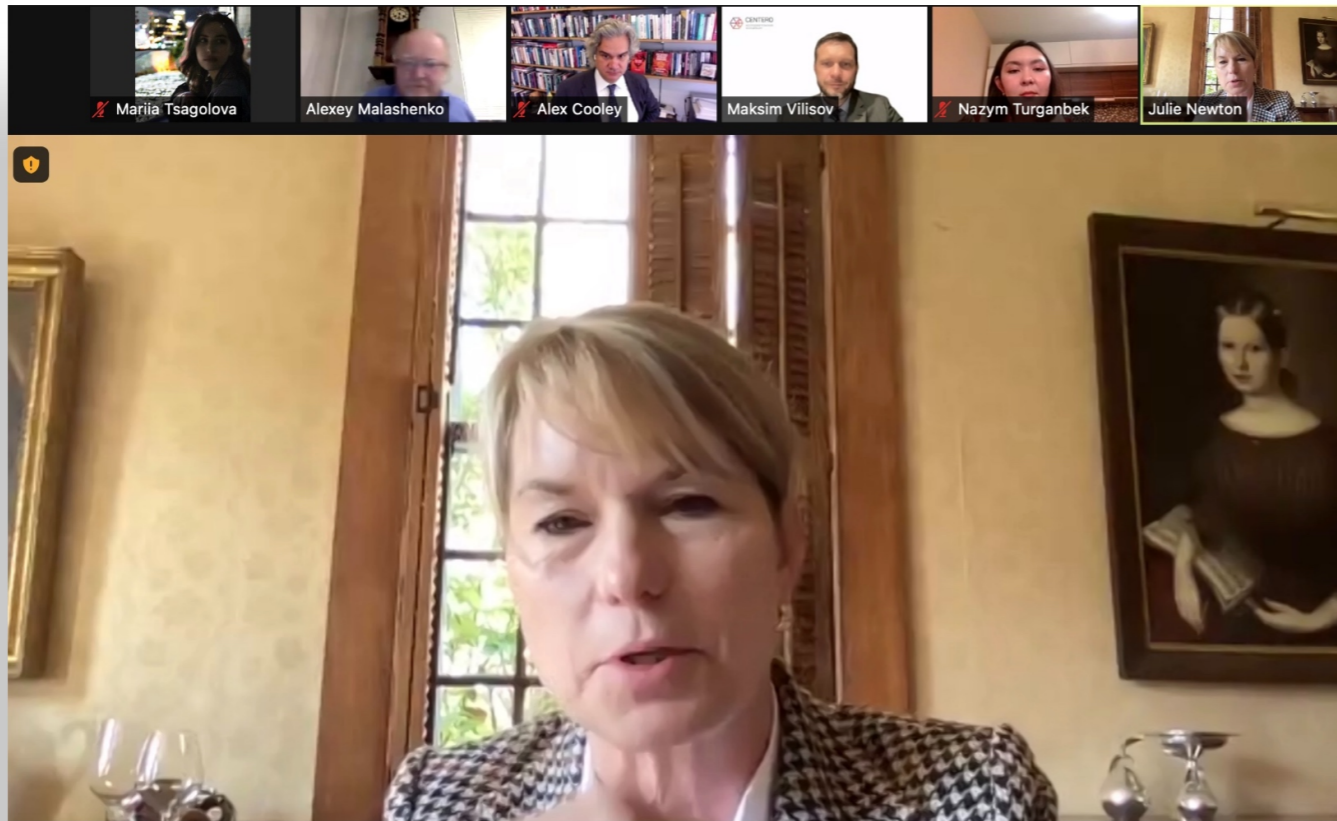
Round table "Central Asia: Soviet Legacies, Post-Soviet Challenges and Political Future of The Region", 10.2021