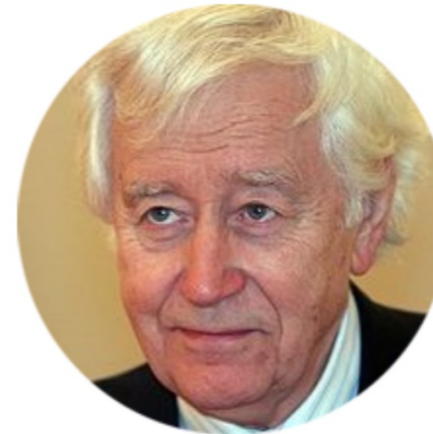
AMB. ROLF EKEUS

the academician of the Russian Academy of Medical Sciences, director of several NGOs. Co-president of the "International Physicians for the Prevention of Nuclear War".